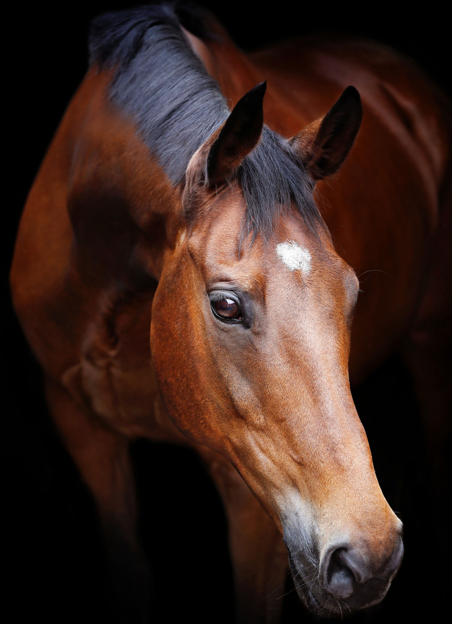
Bobs Worth - Cheltenham Gold Cup Winner

Whilst most of the horses featured have competed across the UK and Ireland, many of them have also competed to the highest international level, so therefore appeal to a global audience.