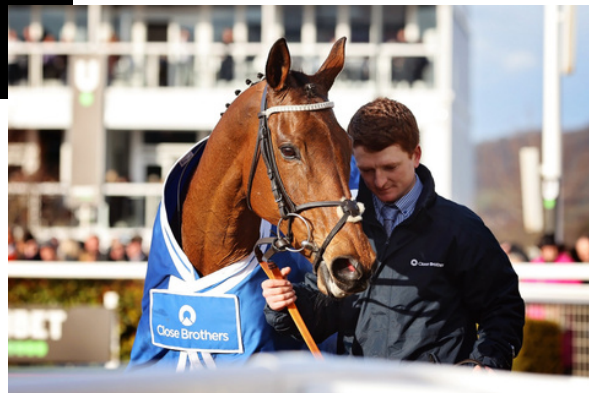
Honeysuckle - Champion Hurdle winning mare, unbeaten on 19 starts