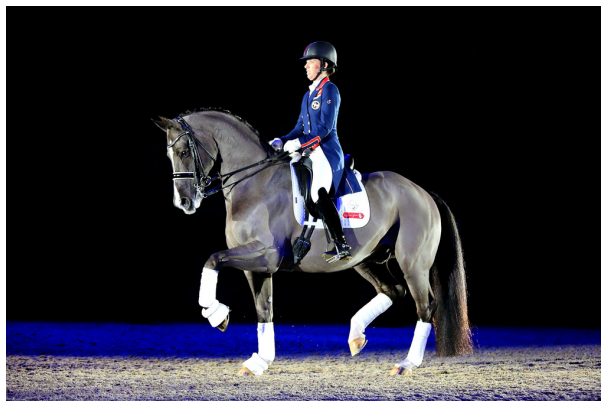
Valegro - Holder of all Dressage World Records, Triple Olympic Gold Medallist Also pictured, his sire, Negro, who is also a legend in his own right as a key sport horse stallion.