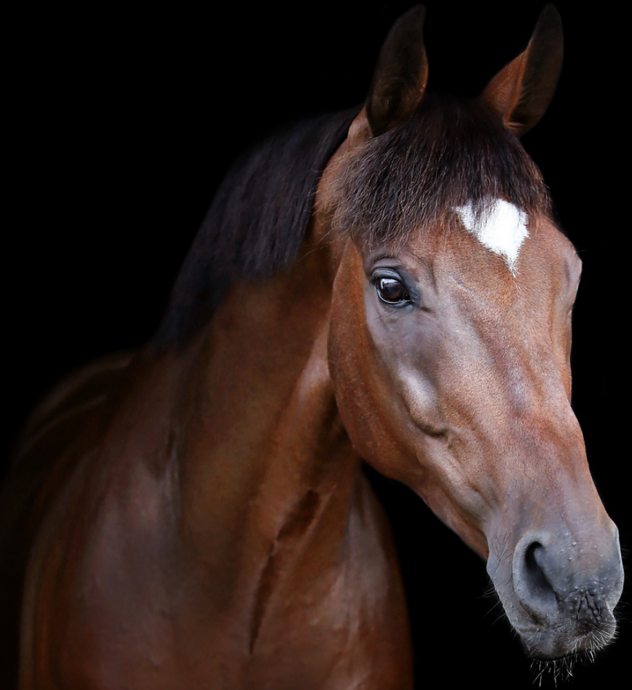
Tiger Roll - Dual Grand National Winner

I believe these elites are born with that something a little extra special. Unlocked by the humans who are devoted to them, and it is that tiny spark, a desire to be great, that makes them a legend.