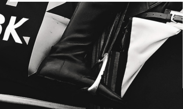
Shishkin - Grade 1 Hurdler, unbeaten on 10 starts